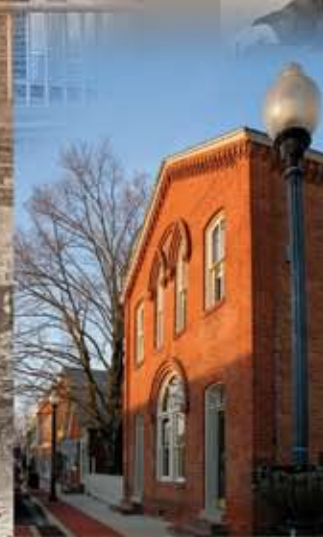
Washington Hotel, Princess-Anne, Md.